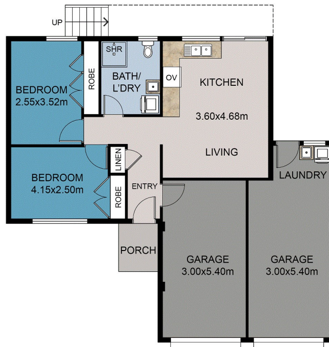
DOWNSTAIRS FLOOR PLAN

This floor plan including furniture, fixture measurements and dimensions are approximate and for illustrative purposes only. BoxBrownie.com gives no guarantee, warranty or representation as to the accuracy and layout. All enquiries must be directed to the agent, vendor or party representing this floor plan.