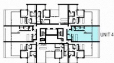
LEVELS 1 TO 6 KEYPLAN

LIVING AREA = 73.6m 2 BALCONY = 20.0m 2 TOTAL = 93.6m 2