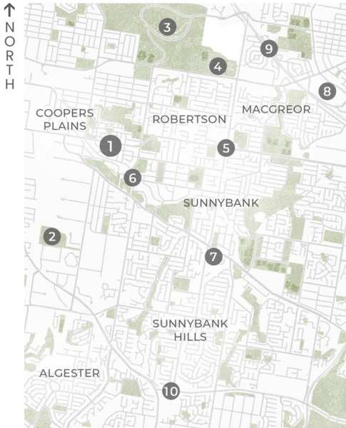
:: LOCATION MAP