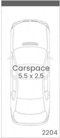
:: FLOOR PLAN Basement