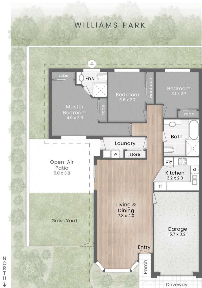
:: FLOOR PLAN & SITE PLAN