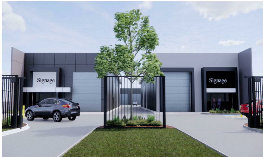
10 PROPOSED NORTH ELEVATION ARTIST IMPRESSION STREET VIEW