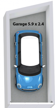
UNDERGROUND SECURE PARKING