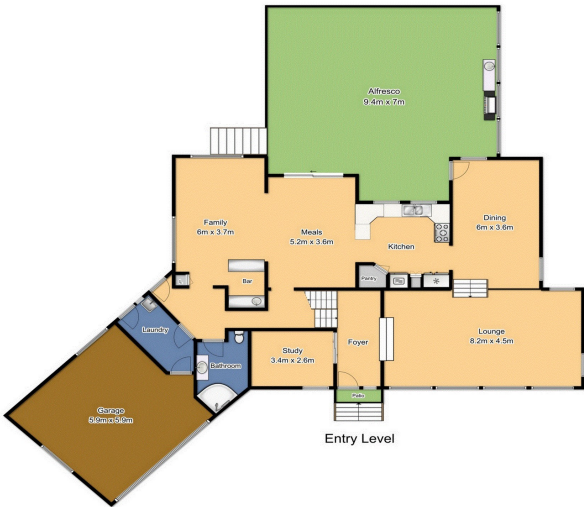
21 Cormorant Place Berkeley (Entry Level) Total Approx. Floor Area 501.1 SQ.M (Entry Level Floor Area 285.9 SQ.M)

Open2View used the best endeavors to make the information on this floor plan accurate and true. Unit area if shown are approximate only.