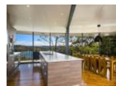
FIG TREE HOUSE - Watch the Sunset Over Pittwater!