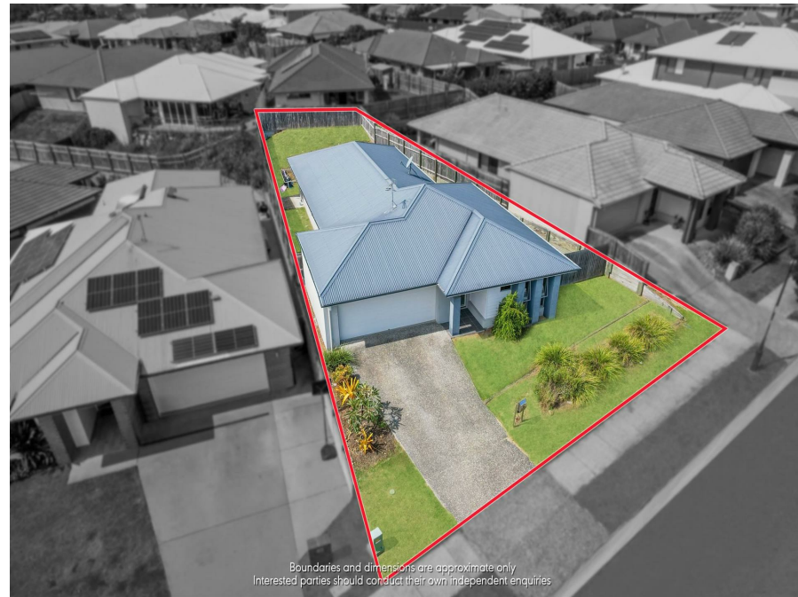
Boundaries and dimensions are approximate only Interested parties should conduct their own independent enquiries