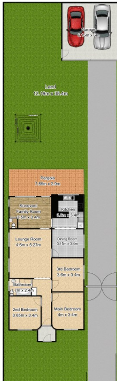
55 Culver St Monterey

Please note these measurements are approximate only. These measurements are not warranted or guaranteed to be correct and should be used as a rough guide.