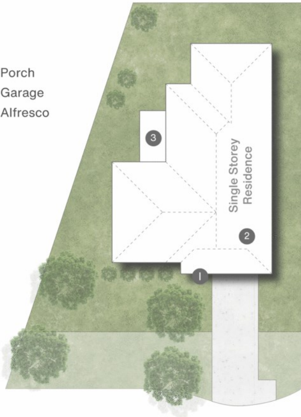
Mount Dagular Crescent