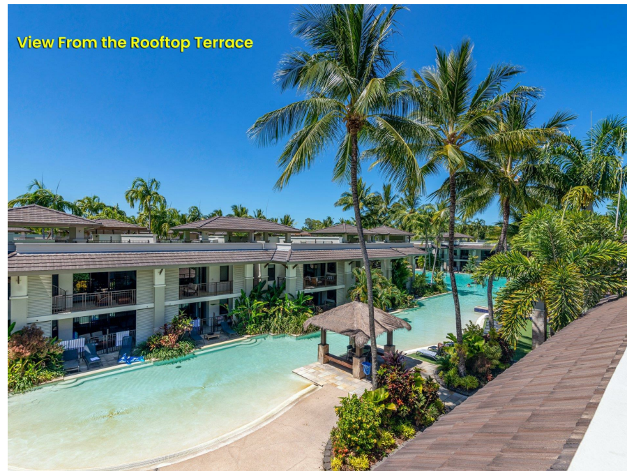
View From the Rooftop Terrace