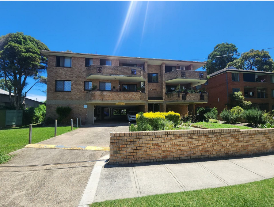
View Wednesday at 10.15am - 10.30am